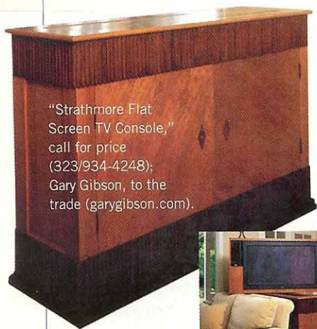
"Strathmore Flat Screen TV Console," call for price (323/934-4248); Gary Gibson, to the trade ( garygibson.com ).

TODAY'S FLAT-PANEL TELEVISIONS ARE COMING OUT OF THE ARMOIRE.