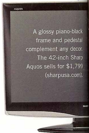
A glossy piano-black frame and pedestal complement any decor. The 42-inch Sharp Aquos sells for $1,799 ( sharpusa.com ).