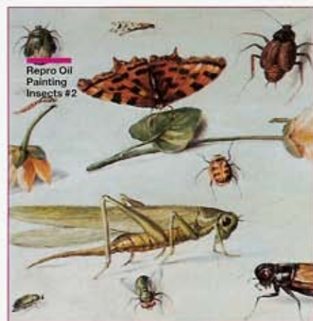
Repro Oil Painting Insects #2

Los Angeles is brimming with home design shops. Five stores opened by local designers and tastemakers show that modern no longer means bare by mixing high concept items with intriguing antique finds and nature-inspired pieces. Each shop is different from the next in many ways, but all of them unite the old and the new to create an eclectic but still modern aesthetic.