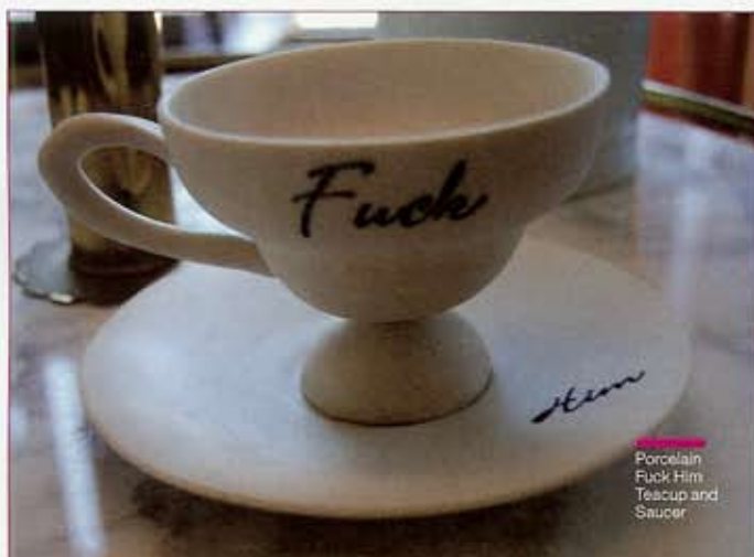
Porcelain Fuck Him Teacup and Saucer