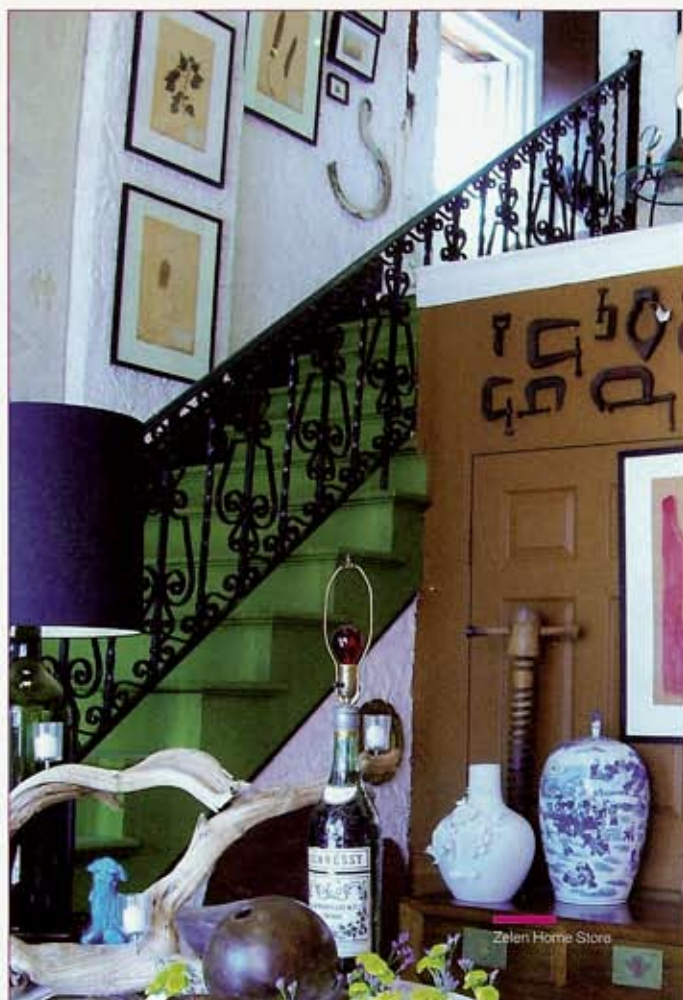
Zelen Home Store